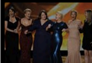
Photos: Best and Worst Emmy Moments