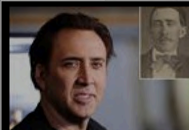
Gallery: Celebs Who Could Be Vampires