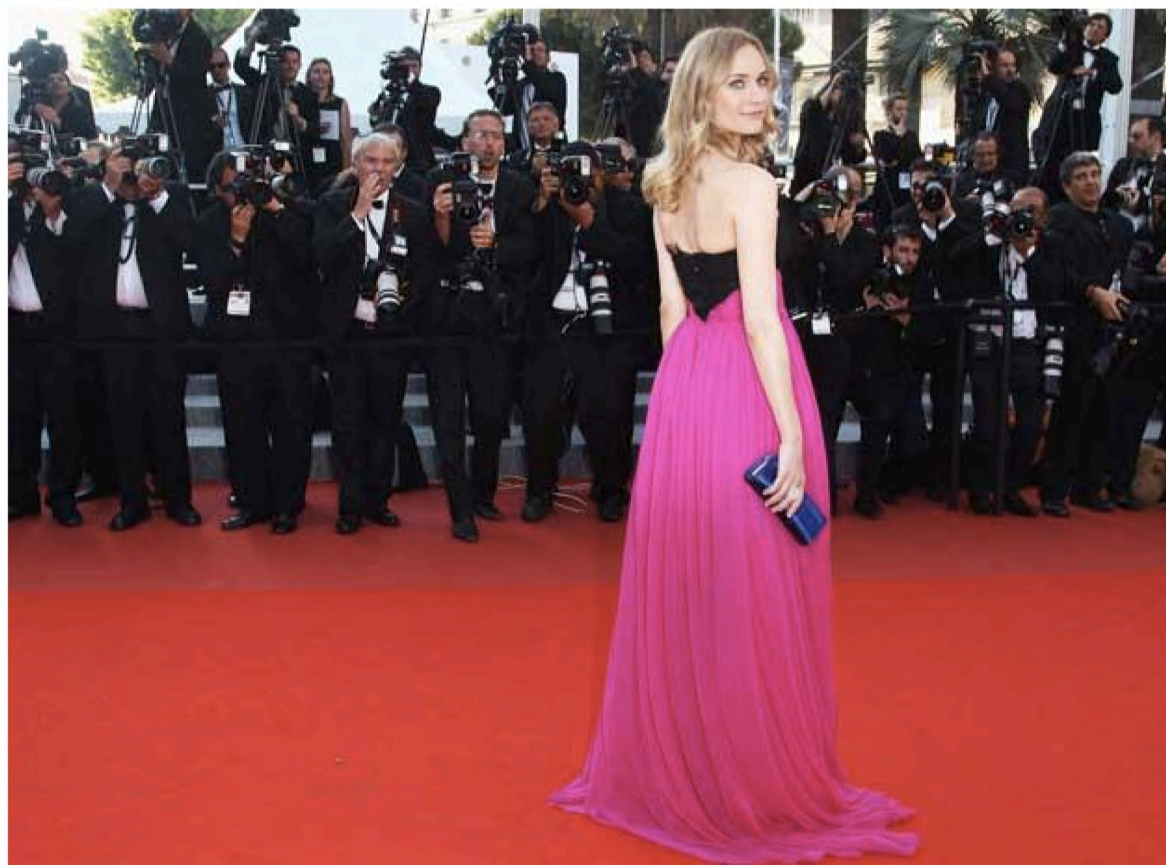
Want to see a star like Diane Kruger? Check out our hot spots.

It's that time of year again; the time when Toronto comes alive with A-list celebs and A-list parties. If you don't find your name on the guest list or your invite was "lost in the mail," don't fret. We've compiled a list of Toronto's top ten hottest celeb-spotting venues. If your timing is right and you've got a little luck on your side, you may just be able get that coveted pic of your fav celeb.