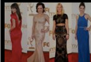
Photos: Rate the Emmy Fashions