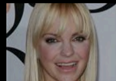
Celebrity Makeup Mishaps